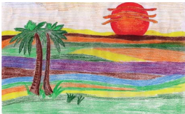
Nadira Akhter, Class 5, Kazi Nazrul Islam AS